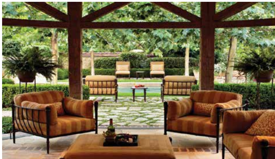
Outdoor living spaces and the use of natural gas design elements are two key trends for spring and summer 2021 .