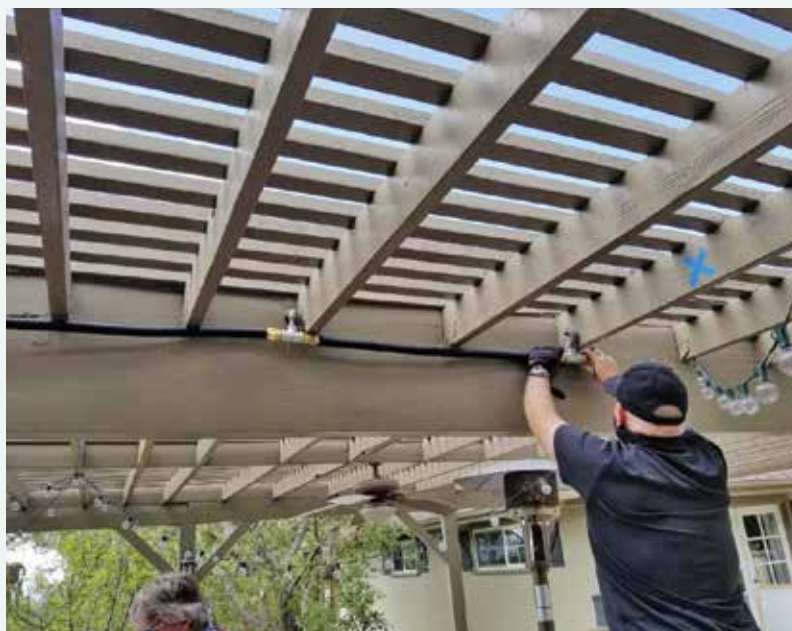
Corrugated Stainless Steel Tubing, or CSST, is an ideal match for outdoor rooms because its flexibility allows it to be installed in a variety of configurations to meet design needs.

"CSST allows you to create an infrastructure that is easy to install, is low maintenance and can give you flexibility," he said. "Depending on how big your outdoor use is going to be, you can set up as simple or as complex an arrangement as you need with relatively low cost and fast installation. I see CSST and outdoor lifestyles as a great partnership with consumer features, smart technologies and innovative, adaptable piping systems." ■