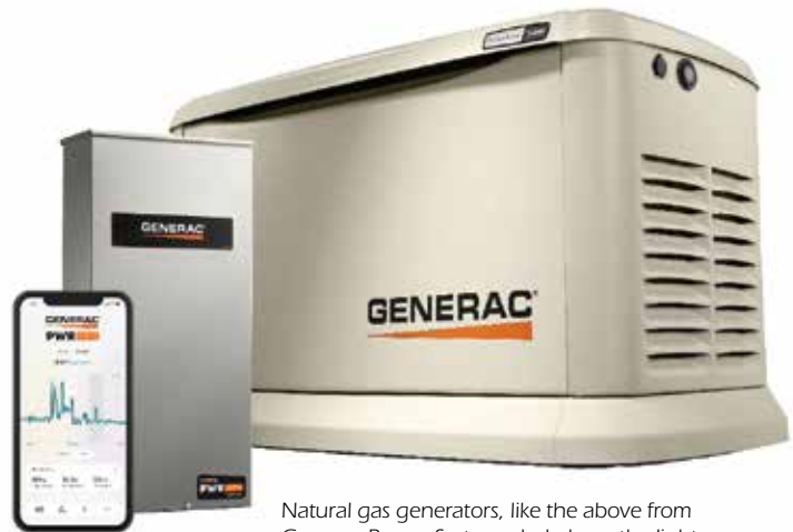
Natural gas generators, like the above from Generac Power Systems, help keep the lights on and appliances working during a power outage.

Prices for natural gas generators chiefly depend upon size and in-