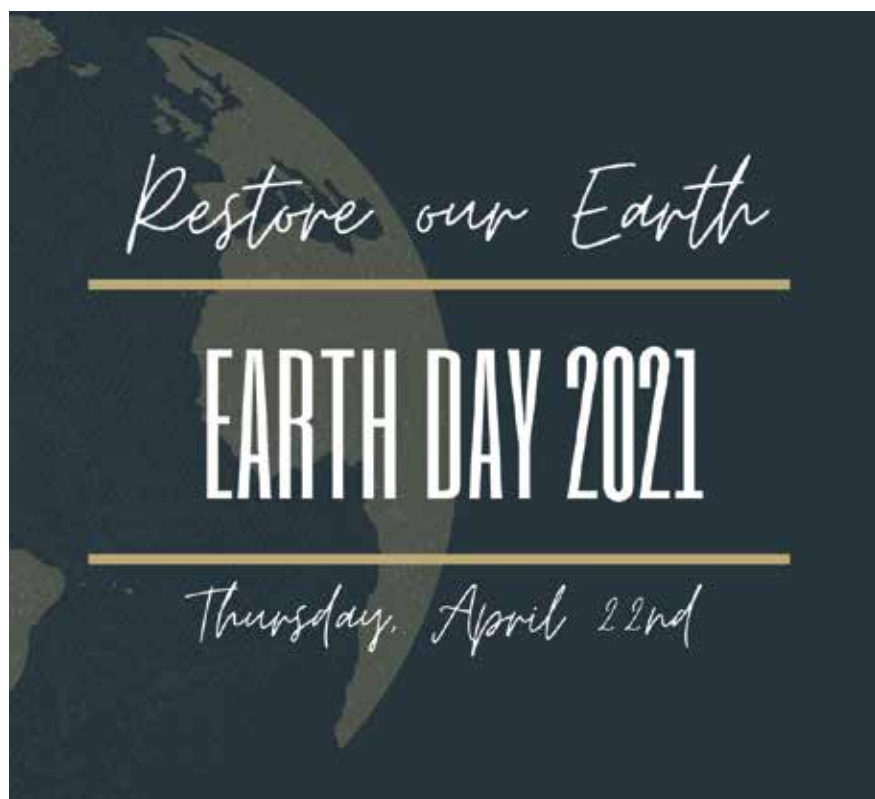
The theme of this year's Earth Day, which takes place April 22, is “Restore the Earth.” Clean-burning natural gas plays a significant role in helping to preserve the environment.

The U.S. Department of Energy analyses indicates that every 10,000 U.S. homes powered with