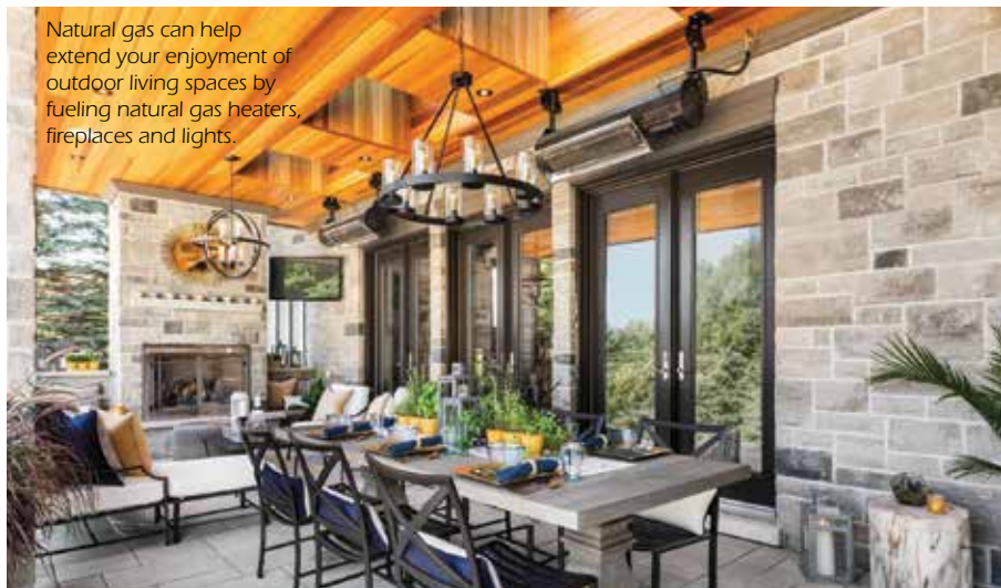
Natural gas can help extend your enjoyment of outdoor living spaces by fueling natural gas heaters, fireplaces and lights.

With natural gas, outdoor living spaces can offer an inviting atmosphere for gatherings long after the chill of autumn comes around. ■